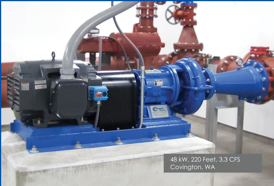
48 kW, 220 Feet, 3.3 CFS Covington, WA

Common applications are at flow or pressure control locations. Standard equipment packages include all components required to recover lost energy.