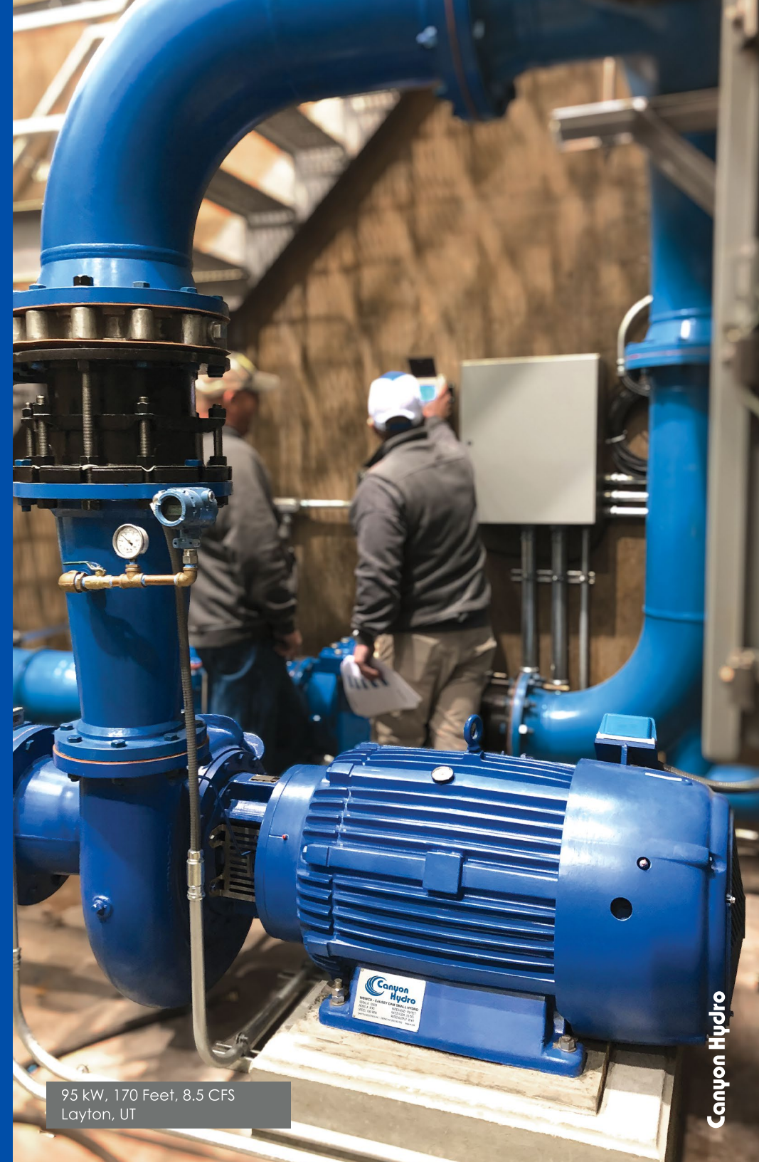
95 kW, 170 Feet, 8.5 CFS Layton, UT